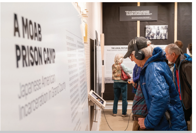
Visitors explore the current exhibition on display at the Member's Preview in February 2024. A Moab Prison Camp: Japanese American Incarceration is on display at the Museum until June 29, 2024.

On April 18th at 2pm and 6pm the Museum will host a free film screening of "Injustice at Home: Looking like the Enemy." This short film features the inspiring stories of people in the Japanese American community, focusing