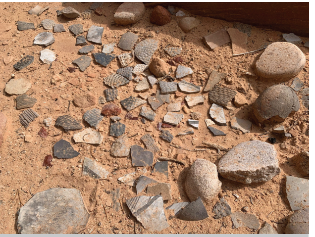
Potsherds collected around a dwelling in Southeast Utah. Chat with an archaeologist at the Museum every Tuesday this April and May about what we can learn from pottery!

on Japanese Americans during WWII, both inside and outside the evacuation zone, chronicling their struggles and perseverance.